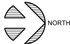
1 FIRE ACCESS PLAN 1" = 40'-0"